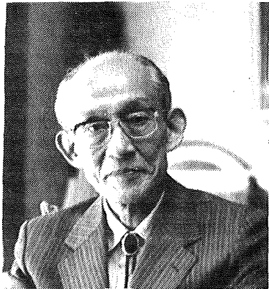
Doshu K. Ueshiba

Doshu: Yes, that is correct. Too many people seek immediate results (of Aikido training and dojo administration) nowadays such as, "If you do this, such and such will happen." Just like the stock market boom in Japan. Did I win or lose? I